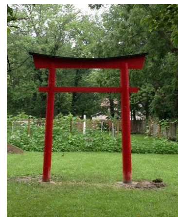
This torii was installed by a Vine Street resident in Warren with help from the Side Lot Incentive Program.