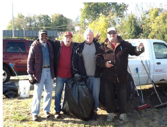
TNP participated in the 2013 Make A Difference Day, supporting volunteers in a clean-up effort along the Warren Bike Path.