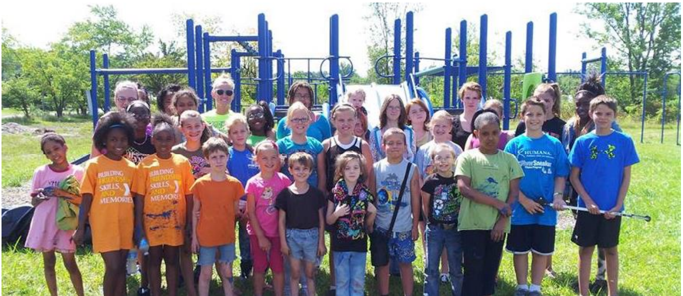
ABOVE TNP's Second Annual Park Paint Project with the YMCA's Kids Club and Girl Scout Troop 80588 at Interfaith Park on Niles Road.

The vision of TNP is to transform communities into meaningful places where people invest their time, money, and energy into their homes and neighborhoods; where residents have the capacity to manage day-to-day issues; and where neighbors feel confident about the future of their neighborhood.