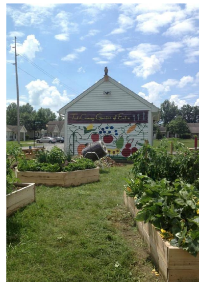
RIGHT TNP assisted staff and residents at Tod's Crossing in creating the Garden of Eatin' on Warren's SW side.

TNP offers tools and supplies, assistance with water infrastructure, technical assistance and community outreach to other existing and emerging gardens throughout Warren including the Central City Unity Garden, the Laird Community Garden, Urban Community Victory Garden, and the Garden of Eatin' at Tod's Crossing. GROW partnered with Inspiring Minds' youth gardening program in the summer of 2013, at the Urban Community Victory Garden.