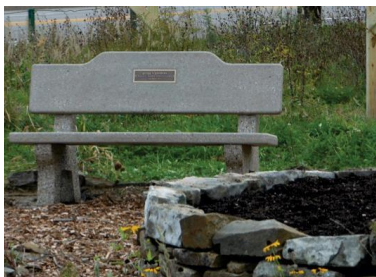
RIGHT A bench and raised bed were installed at the WGH Memorial Garden, Elm and Atlantic.