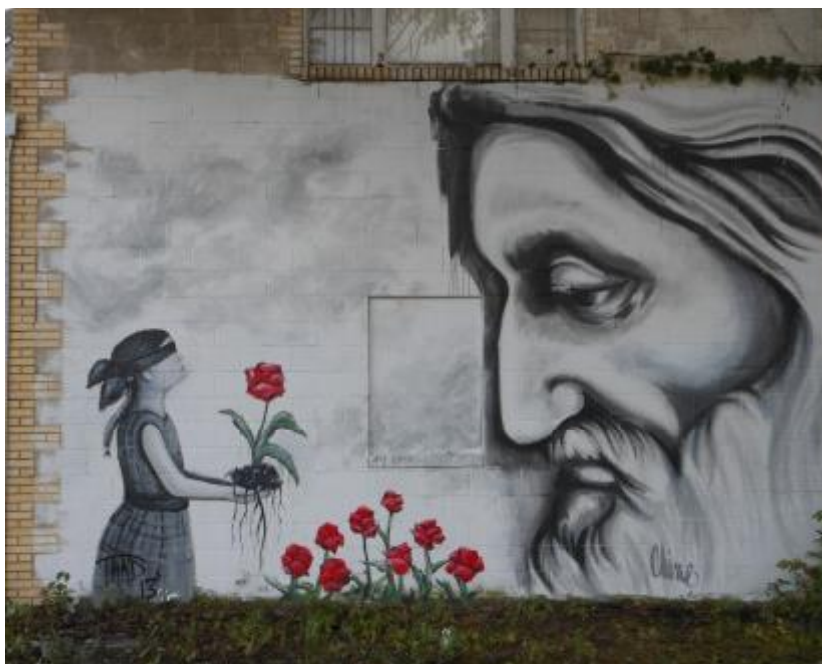
BELOW A mural installed by Aaron Chine at Porter and Vine.