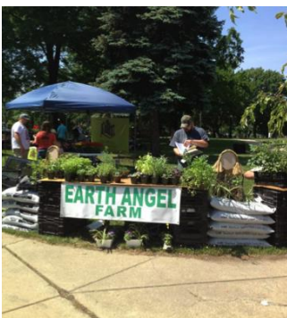
BELOW IN 2013, TNP PARTNERED with Lake-to-River Cooperative and Humility of Mary Health Partners (St. Joseph's Hospital) to establish and manage the Warren Farmers' Market in Downtown Warren's Courthouse Square.