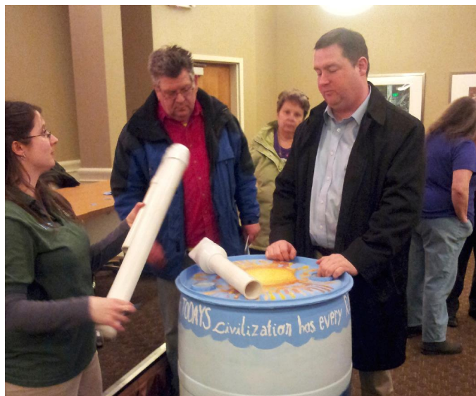
ABOVE TNP partners with the Trumbull County Soil and Water Conservation District to offer a rain barrel workshop.