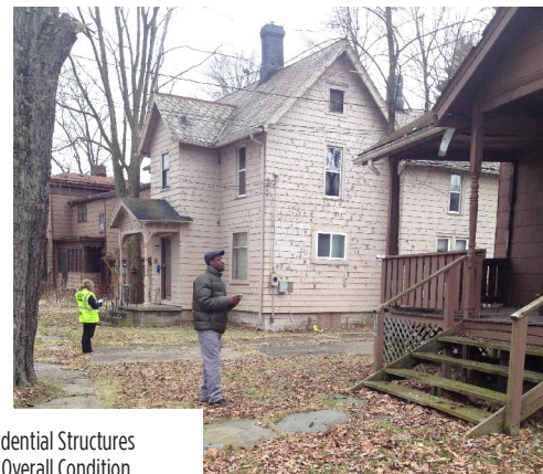
Vacant Residential Structures Graded on Overall Condition

In 2013, TNP engaged more than 100 residents in localized meetings to discuss assets, challenges, and goals facing each neighborhood and to set the stage for a planning process that will join citizen input with comprehensive data. Residents had a lot to say about the positive aspects of diversity, neighborhood leadership, community gardens, and accessibility of local assets. They were concerned with crime, code enforcement, vacant property, and resi-